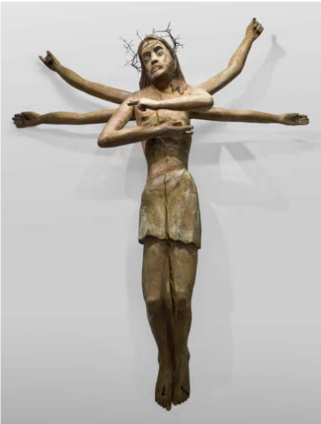
Anfim Khanykov – Crucified Shiva