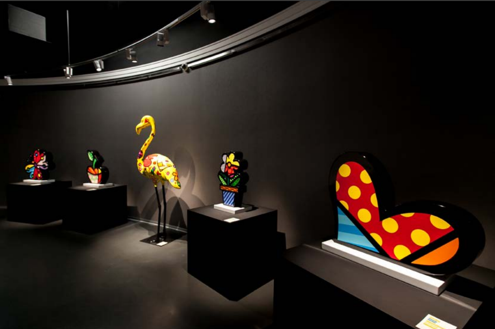
Romero Britto: The Formula of Success , 2015