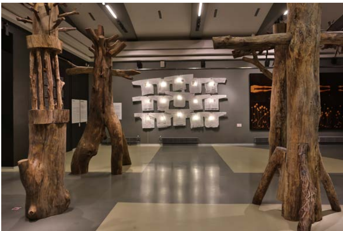
Nikolay Polisskiy—Borders of Empire