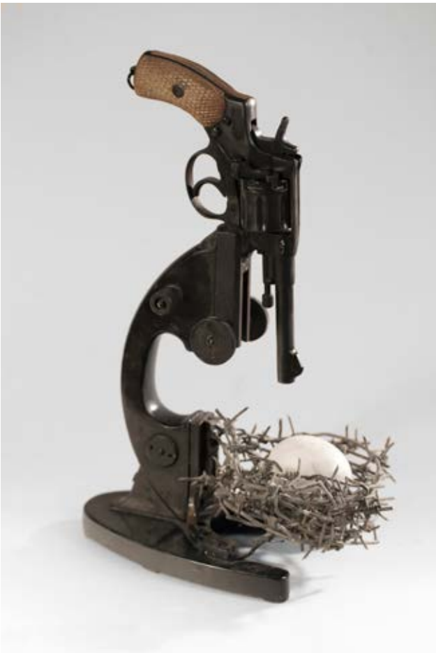
Yuliy Rybakov – Big Brother