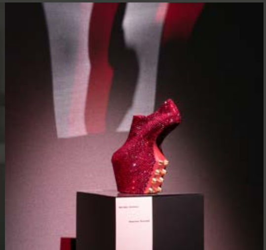
Genesis. Designer Shoes of the Future. 2015–2016