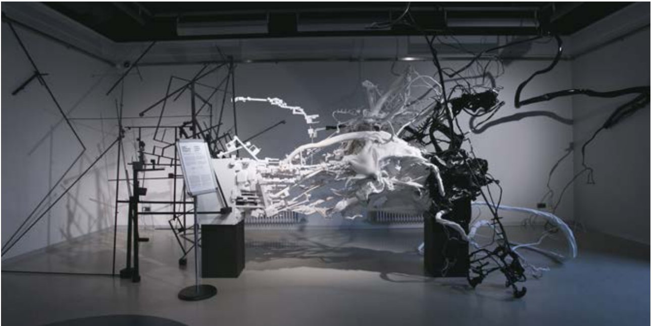
Dmitry Kawarga – Model of Bipolar Activity

paid to curatorial commentary accompanying the works. Such texts are an important feature of Erarta's approach and are created especially to give viewers additional touch points and connections with art.